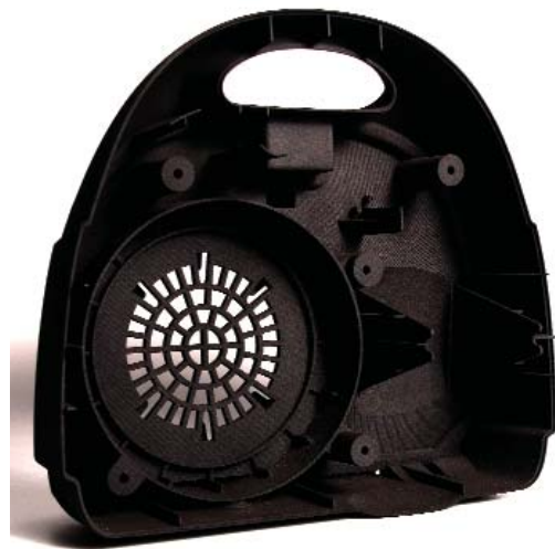
One-part, black powder contributes to uniform black color.